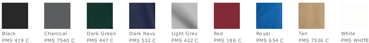
Black PMS 419 C Charcoal PMS 7540 C Dark Green PMS 447 C Dark Navy PMS 532 C Light Grey PMS 422 C Red PMS 186 C Royal PMS 654 C Tan PMS 7536 C White PMS WHITE